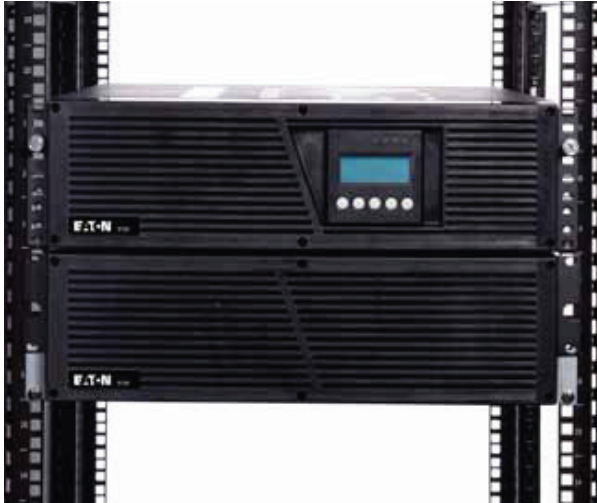
The 9135 (top) fits easily into a rack with an EBM (bottom) and a PPDM (not pictured)