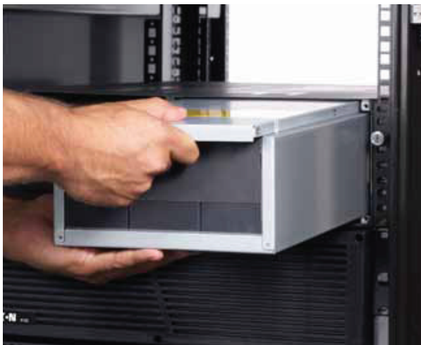
Even non-technical users can easily replace the hot-swappable batteries or power modules without interrupting power to loads